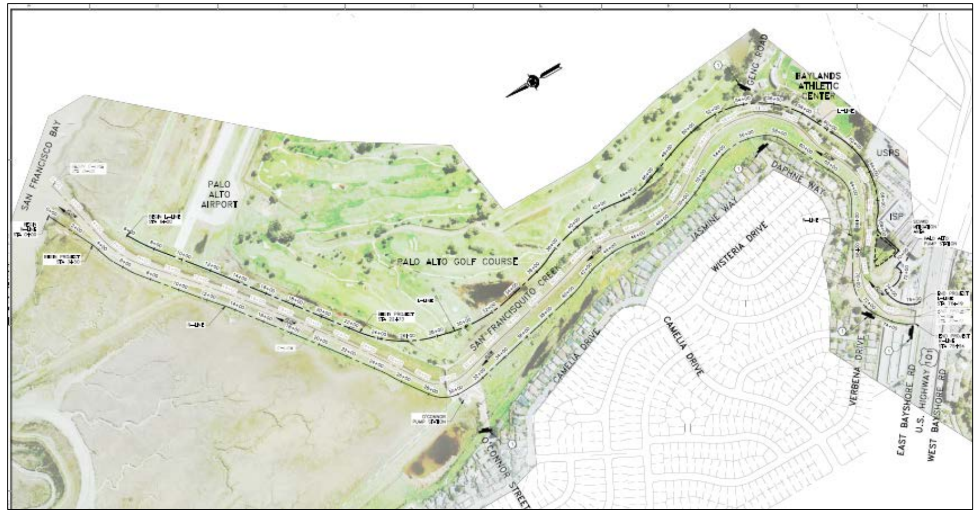
Figure 2. Map of entire project area.