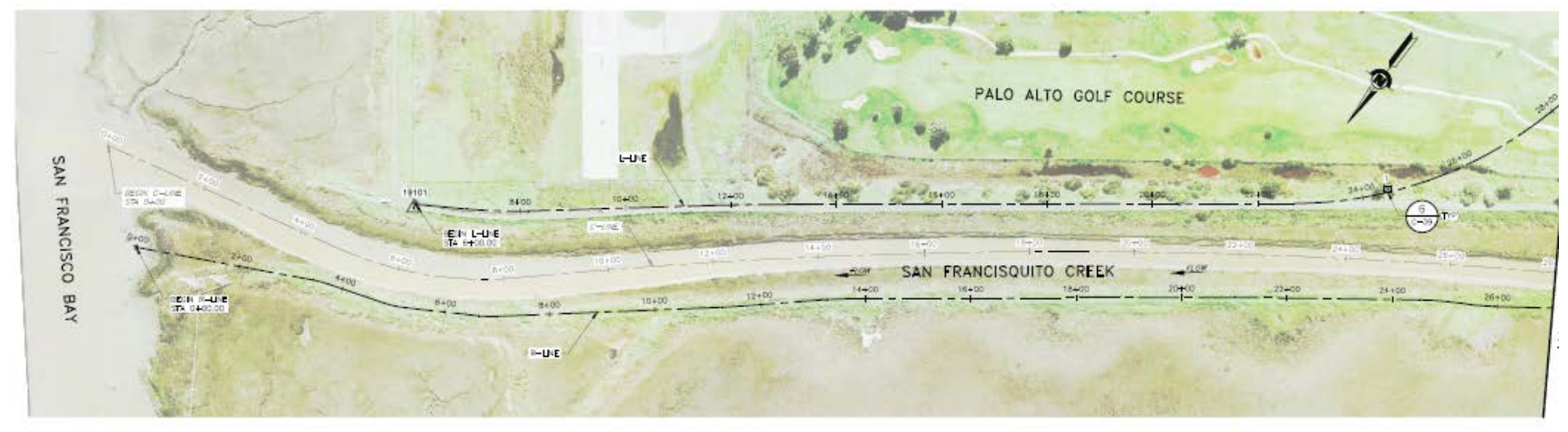
Figure 3. Map of project area from center line STA 0+00 to STA 28+00.