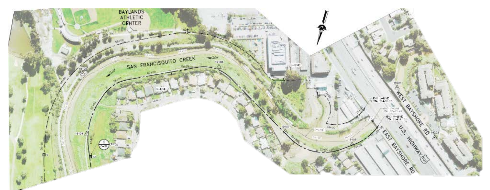
Figure 5. Map of project area from center line STA 52+00 to STA 77+71.